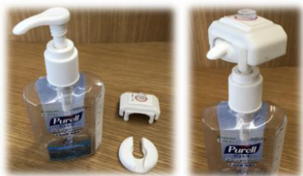
Figure 2 – Disinfection Pump Operation Detection Sensor

By combining the staff's flow line and disinfection pump operation, it is possible to detect the hand disinfection situation. In this way, it is possible to detect the hand disinfection situation at the time of entering the area or approaching the patient. By collecting these data continuously, it is possible to measure the required hand hygiene performance.