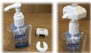
Figure 2 – Disinfection Pump Operation Detection Sensor

By combining the staff's flow line and disinfection pump operation, it is possible to detect the hand disinfection situation. In this way, it is possible to detect the hand disinfection situation at the time of entering the area or approaching the patient. By collecting these data continuously, it is possible to measure the required hand hygiene performance.