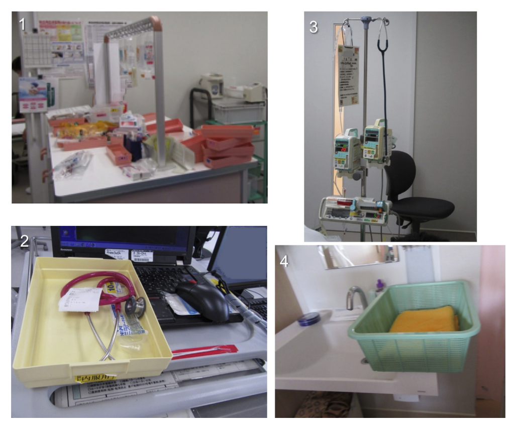
Fig. 3. The nurse station. Containers on a medical treatment table (1), medical instruments on terminals (2), drip stand equipped with devices (3), and a linen container beside a basin (4).