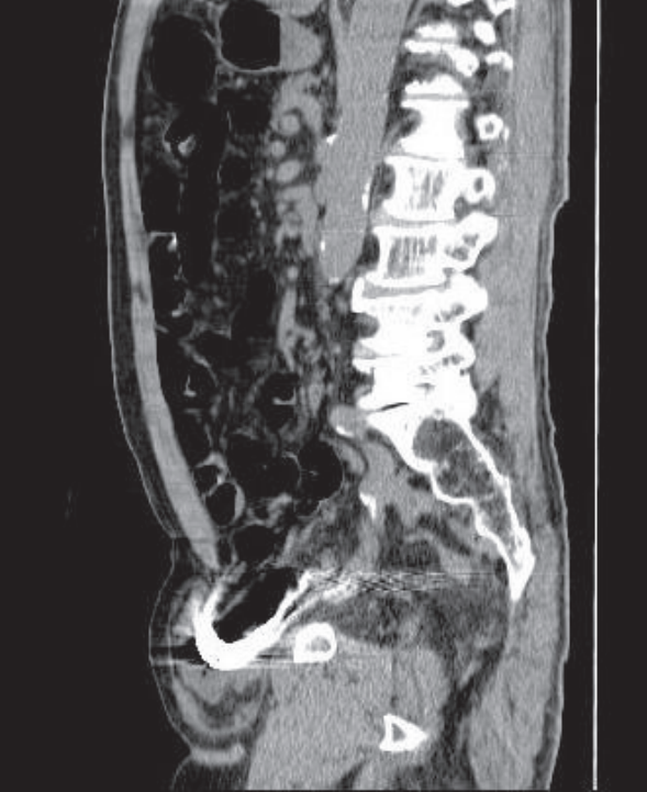
(Figure 2) Abdominal CT showed that there was some amount of colon gas, and that the colonoscope was incarcerated within the sigmoid colon, by the left inguinal hernia.